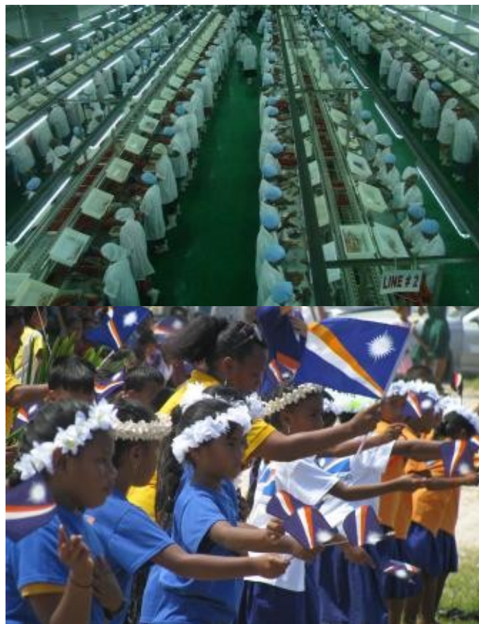
This is the next generation of retirees and beneficiaries who may not have the chance to enjoy the same benefits that many recipients are enjoying now.

The following sections of the Social Security Act of 1990 are amended effective October 1, 2013 :